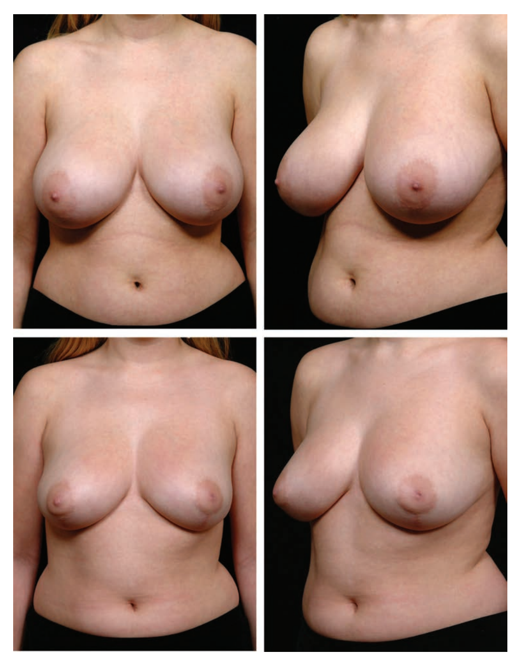
Fig. 3. Y-scar reduction. ( Above ) Preoperative views of a 22-year-old patient with a 34DDD bra size. ( Below ) Postoperative views at 13 months after 270 g of breast tissue was removed on each side.

with both reduction mammaplasty and mastopexy with augmentation. Other techniques such as liposuction-only reduction and "deaugmentation" reduction mammaplasty are even better in this regard but unfortunately are not widely applicable. The Y-scar mammaplasty described in this report allows the observant surgeon an opportunity to reduce the vertical mammaplasty scar pattern further in appropriate candidates. Retaining the normal transition from pigmented areolar skin to adjacent lighter skin in the upper half of the areola